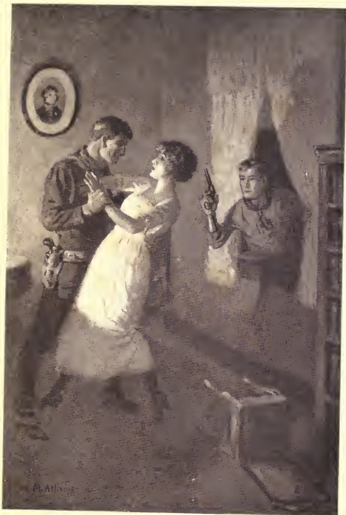
He had come at just the right time